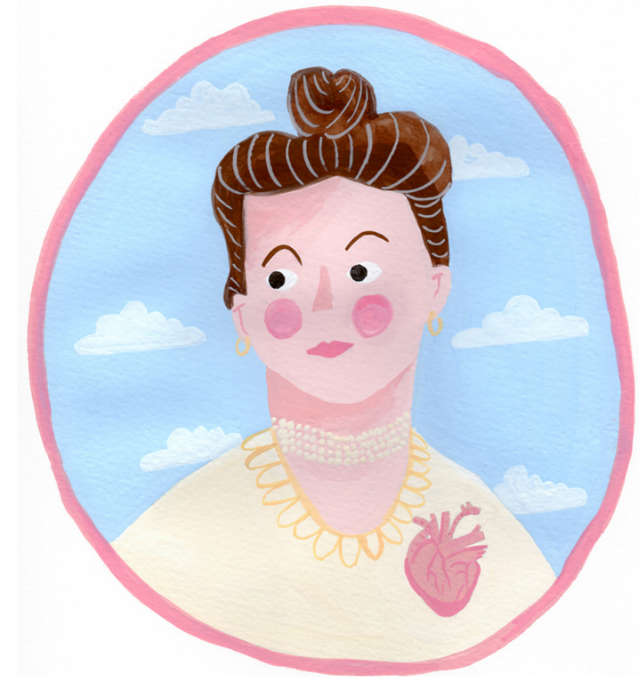
LOUISE DE BETTIGNIES French spy during World War I