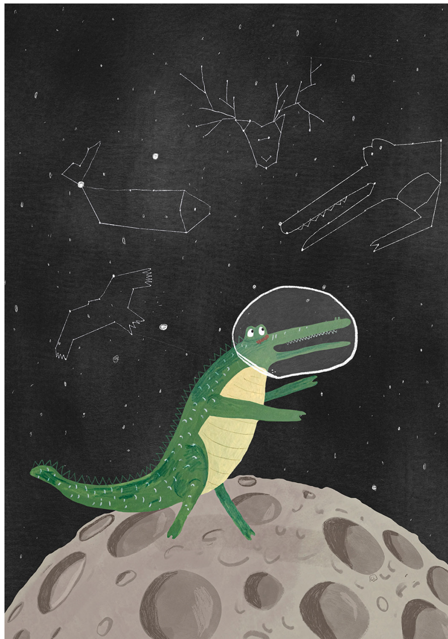
The crocs series of children's illustration