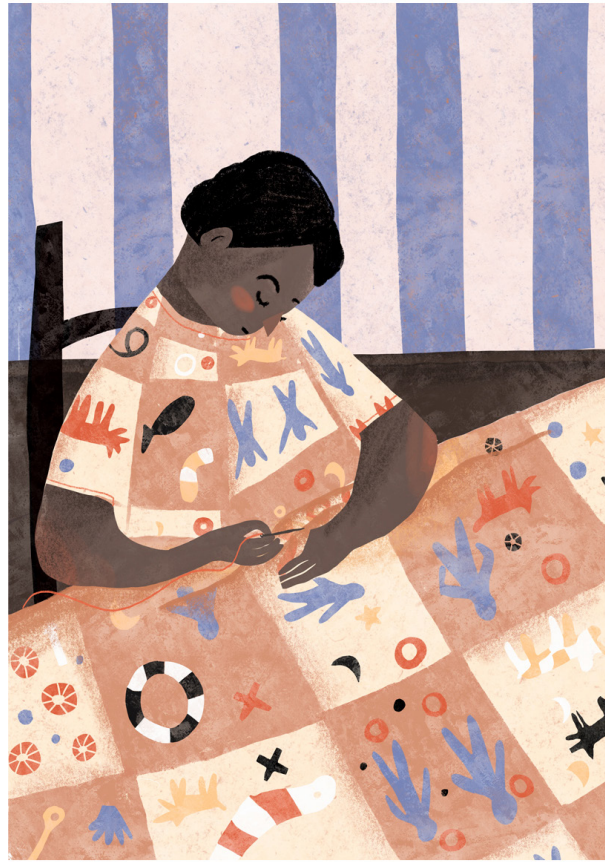
HARRIET POWERS Afro-American artist