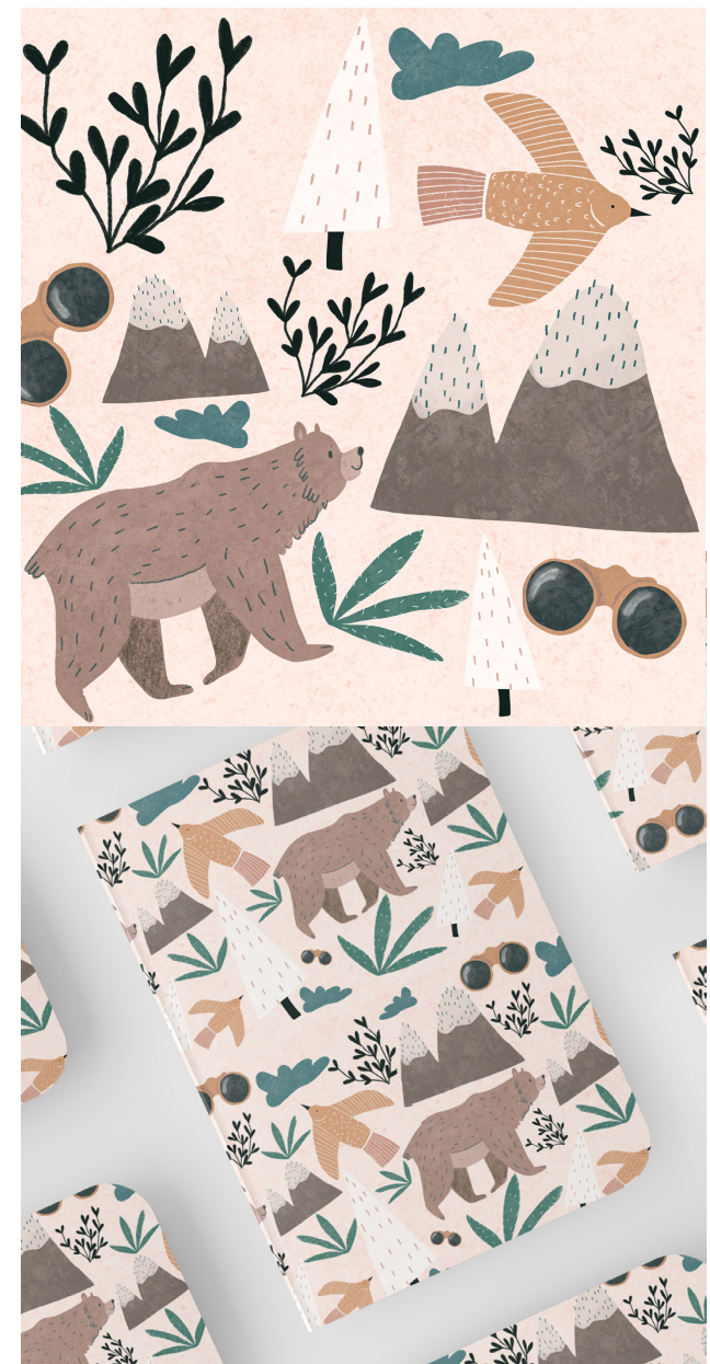
Création of patterns : "Norway" / "Yosemite" for a stationery collection