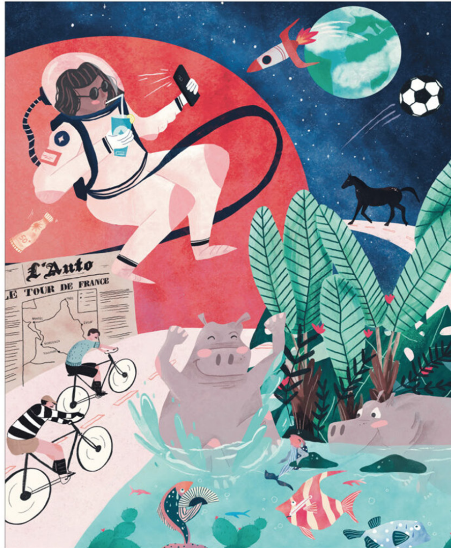
Illustration : Chloé Lelièvre